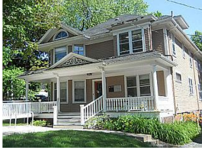
IOI-Canada’s home at Dalhousie University

Registered as the “IOI-Canada Association”, IOI-Canada is a not-for-profit organisation, federally incorporated under the Canada Corporations Act and governed by a Board of Directors. It is guided by the IOI-Canada/Dalhousie Ocean Advisory Committee and staffed by an experienced team of professionals, augmented by Senior Research Fellows who contribute to its activities. IOI-Canada is the regional co-ordinator of the IOI